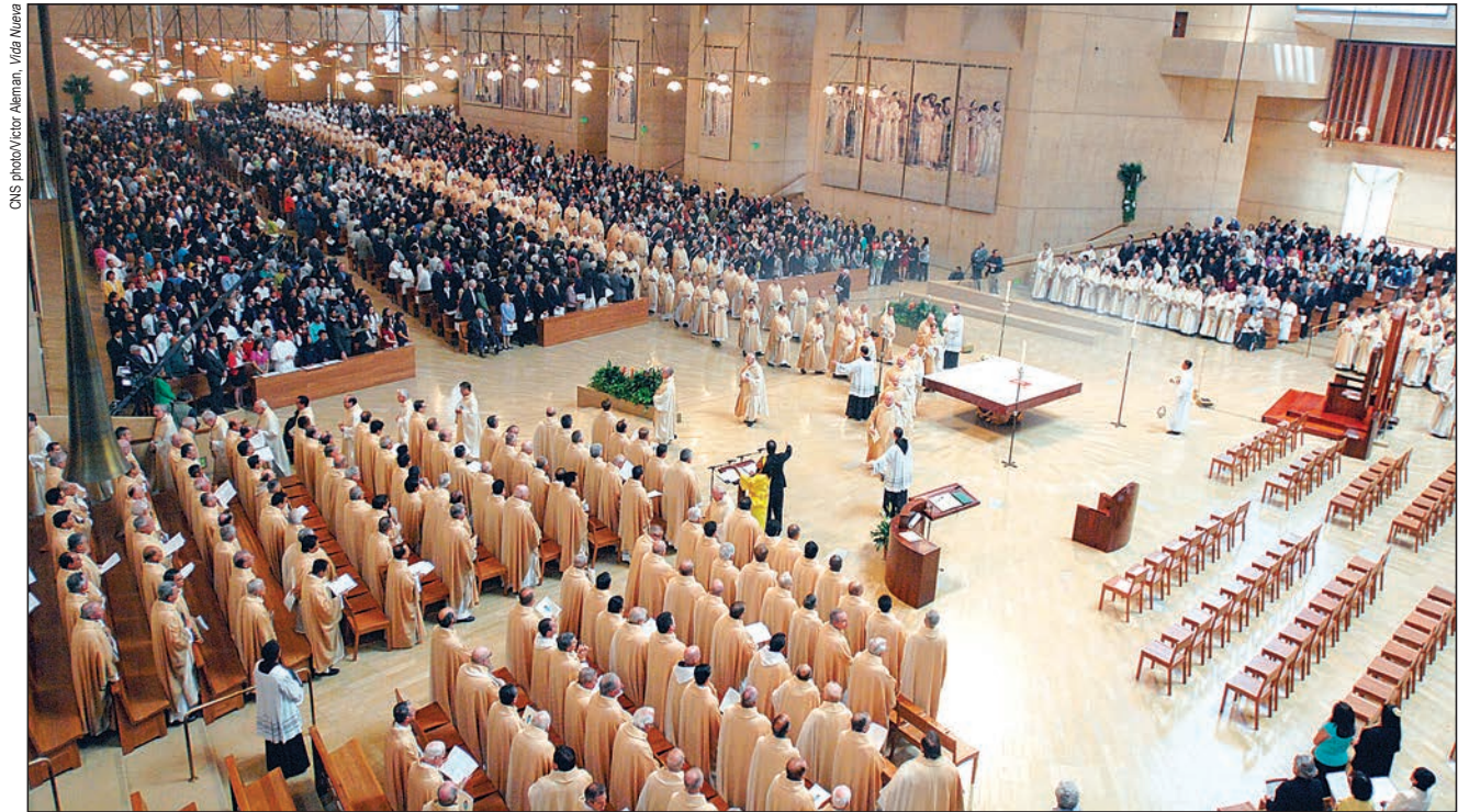
A Mass of reception is held for Archbishop Jose H. Gomez at the Cathedral of Our Lady of the Angels in Los Angeles on May 26, 2010. The former San Antonio archbishop was welcomed as the new coadjutor of Los Angeles. He succeeded Cardinal Roger M. Mahony on March 1, 2011. During his 2002 homily for the dedication of the Los Angeles cathedral, Cardinal Mahony said that "anyone who comes here should continue on their journey with a replenished spirit of respect for all other peoples."

But once people find themselves inside a church, where can they expect to encounter Christ? The Second Vatican Council answered that question, offering assurance in its