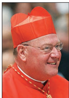
Cardinal Timothy M. Dolan

"President Obama's words today are not surprising since they follow upon various actions already taken by his administration that erode or ignore the unique meaning of marriage," said Cardinal Timothy M. Dolan of New York, president of the U.S. Conference of Catholic Bishops, in a May 9 statement.