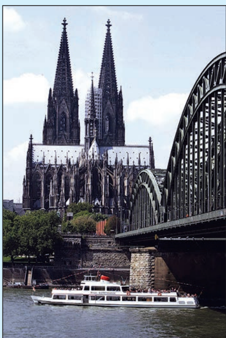
The Catholic cathedral of Cologne is pictured across the Rhine River in Cologne, Germany, on Aug. 1, 2005. The architectural design of this historic church, with its emphasis on verticality and stained-glass windows, leads visitors closer to God.