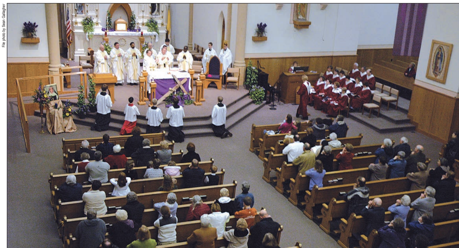
Members of St. Louis Parish in Batesville pray at a 2007 Mass in their parish's church to celebration the canonization of St. Theodora Guérin. Members of the Batesville Deanery faith community and of other parishes, like St. Andrew the Apostle Parish in Indianapolis, foster evangelization through welcoming newcomers and learning more about the Catholic faith.