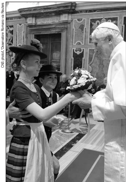
Children dressed in the traditional Bavarian garb greet Pope Benedict XVI with a bouquet of flowers during the pontiff’s 85th birthday celebrations in the Clementine Hall at the Vatican on April 16.

In due time, the Polish pope called then-Cardinal Ratzinger to Rome to serve as Prefect of the Congregation for the Doctrine of the Faith. This new assignment forced the cardinal to leave his beloved homeland and to serve in a